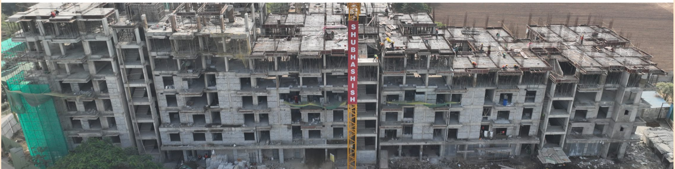
TOWER 6 - LAYING OF SECOND FLOOR ROOF TOWER 7 - LAYING OF FOURTH FLOOR ROOF TOWER 8 - LAYING OF SIXTH FLOOR ROOF

Geeta (Phase-IV) RERA Reg. No. RAJ/P/2022/2208