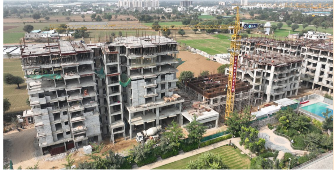
TOWER 4 - LAYING OF SEVENTH FLOOR ROOF DONE TOWER 5 - LAYING OF THIRD FLOOR ROOF DONE