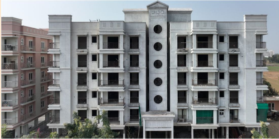
TOWER 3 - EXTERNAL PAINT STARTED

Geeta (Phase-III) RERA Reg. No. RAJ/P/2022/1819