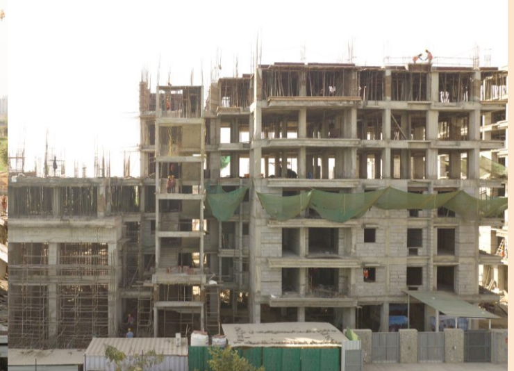
TOWER 5 - ON LAYING OF FIFTH FLOOR ROOF