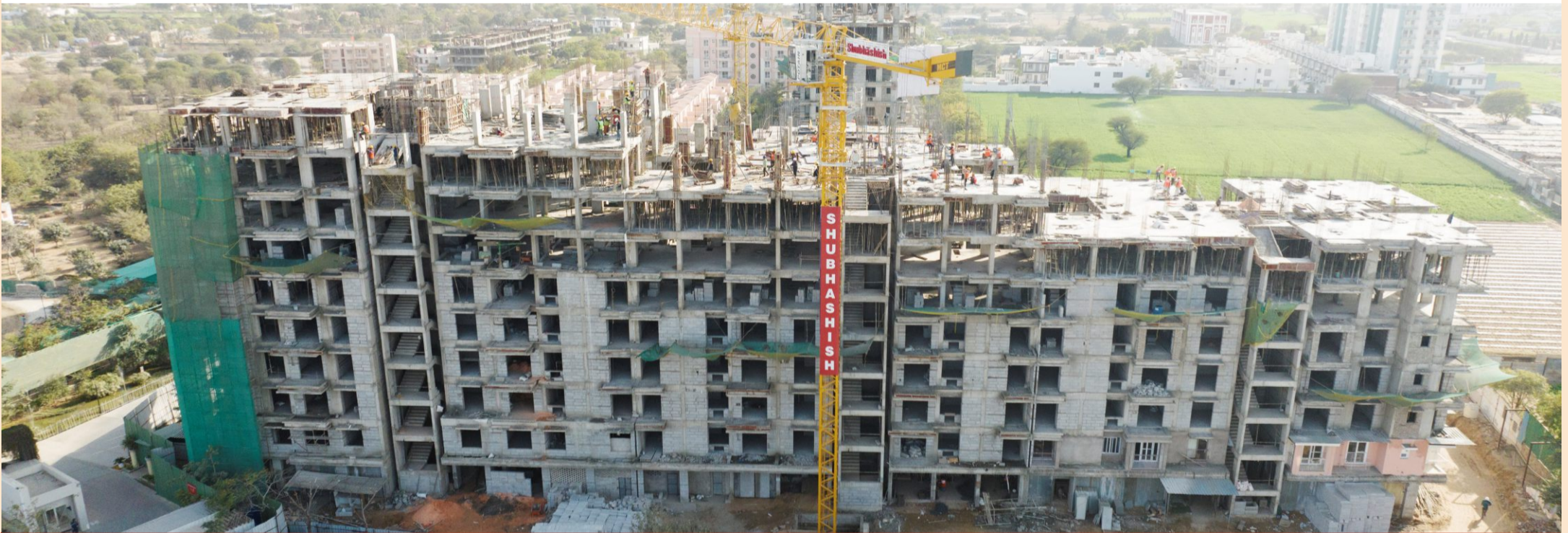
TOWER 6 - ON LAYING OF SIXTH FLOOR ROOF TOWER 7 - ON LAYING OF SEVENTH FLOOR ROOF TOWER 8 - ON LAYING OF EIGHTH FLOOR ROOF

Geeta (Phase-IV) RERA Reg. No. RAJ/P/2022/2208