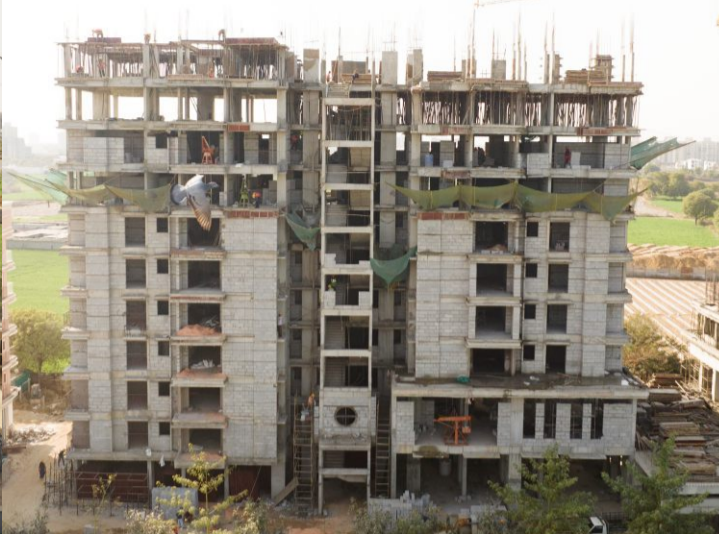
TOWER 4 - ON LAYING OF NINTH FLOOR ROOF