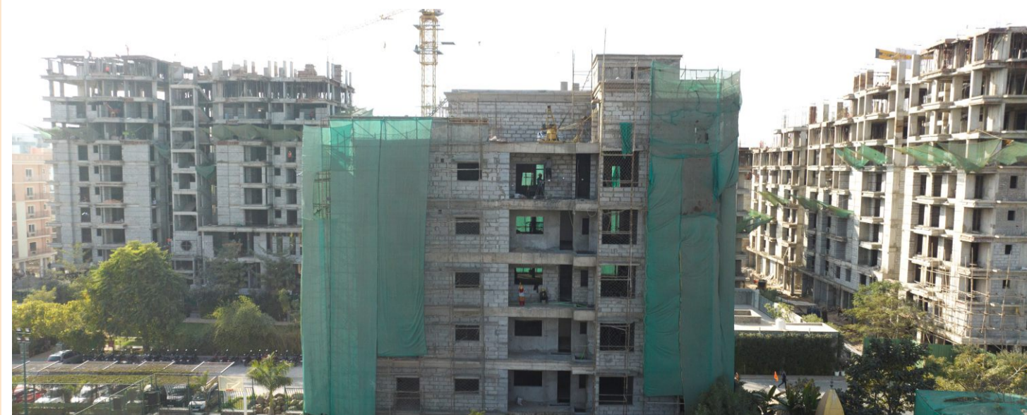
TOWER 9 - ON LAYING OF FIFTH FLOOR ROOF