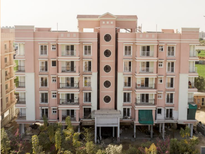
TOWER 3 - ON COMMENCEMENT OF EXTERNAL PAINT

Geeta (Phase-III) RERA Reg. No. RAJ/P/2022/1819